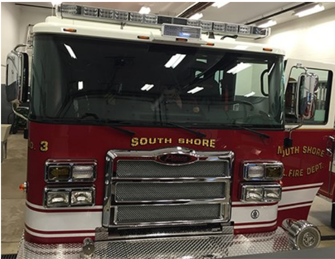
The South Shore Fire Department took delivery of a new 2016 Pierce custom enforcer pumper in March. It has a 1250 gpm pump with a 1250 gallon booster tank. South Shore Fire Department took delivery of the engine from Finley Fire Equipment.