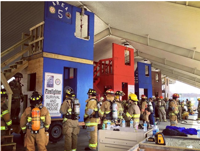
ABOVE: Dixie Fire School Firefighter Survival and Rescue Training In Elizabethtown in March 2016.

Please help support the KFA when you purchase a Kentucky Firefighter tag. Your contribution supports KFA education.