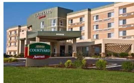
Courtyard by Marriott 3129 Highland Point Drive 270-685-4140