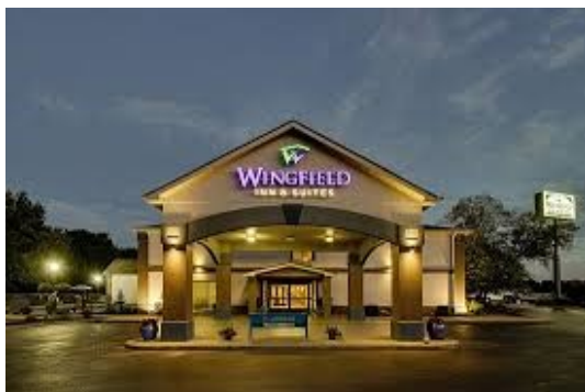
Wingfield Inn 3220 W. Parrish Avenue 270-685-2433