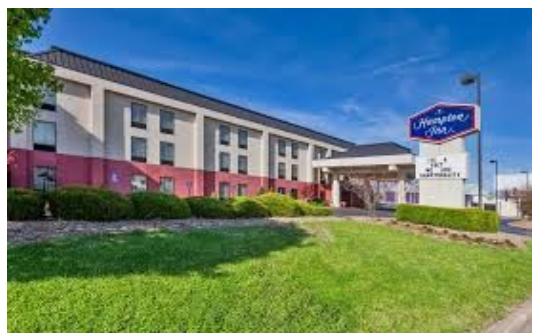
Hampton Inn South 615 Salem Drive 270-926-2006