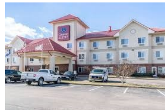
Comfort Inn & Suites 230 Salem Drive 270-926-7675