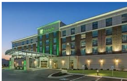
Holiday Inn Riverfront 701 West First Street 270-683-1111