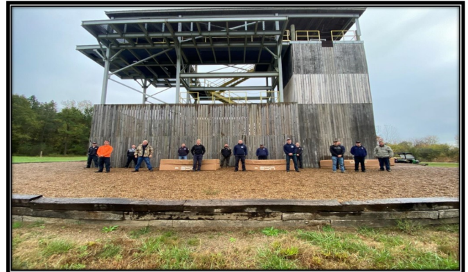
October 2020 High Angle/Rope Rescue Class