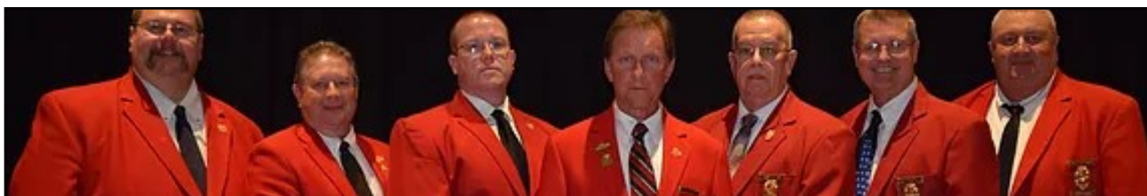
Your KFA Executive Board

National Fallen Firefighters Foundation c/o Fire Hero Family Tree Program PO Drawer 498, Emmitsburg, MD 21727