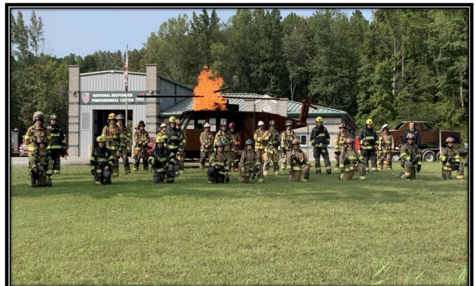
September 2020 "Recruit Week"